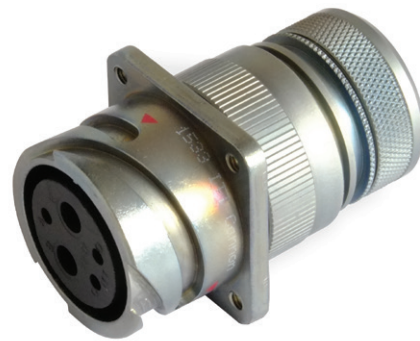
Blue Generation Plating (A240)