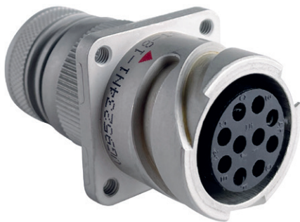
J Plating (A241)

ITT Cannon's Blue Generation Plating This ruggedized RoHS compliant industrial plating delivers an outstanding combination of extreme durability, conductivity and shielding performance. • Salt spray resistance: 500 hours • Shielding effect acc. VG 95373: >65 dB • Conductivity: <10 mOhm • Zinc nickel plating chemistry • RoHS and REACH compliant